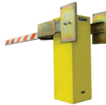
StrongArm 28 Up to 28 ft Center yoke 5 s open / 6 s close