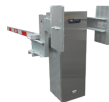
StrongArmDOT 28 Up to 28 ft Center yoke, breakaway 5 s open / 6 s close