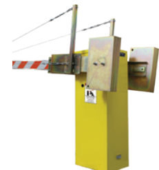
StrongArm 36 Up to 36 ft Center yoke 8 s open / 8 s close