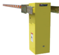
StrongArm 20 Up to 20 ft Side mount or center yoke 3 s open / 4 s close