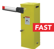
StrongArm 14F Up to 14 ft Side mount, breakaway 2 s open / 3 s close